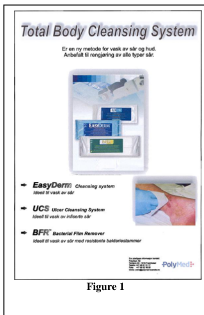
Sign Used at the Exhibit Booth